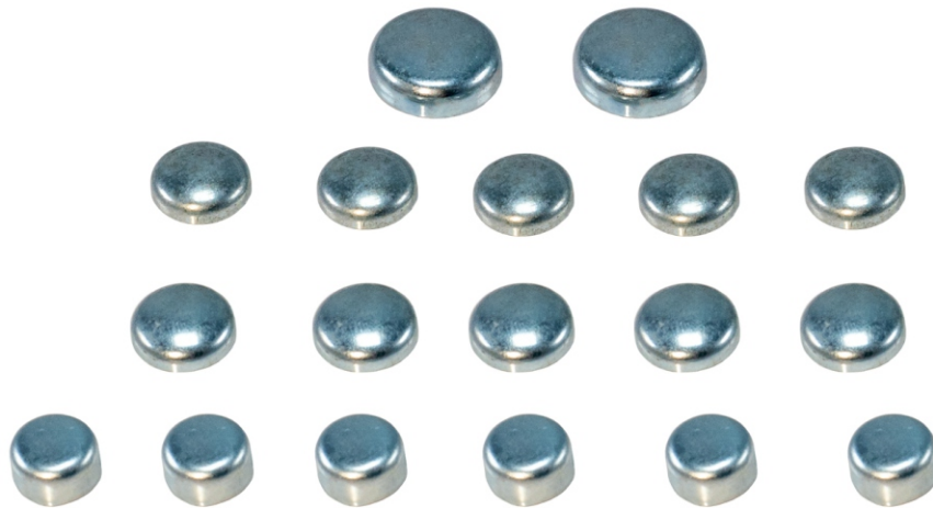
Cylinder Head Expansion Plug Kit