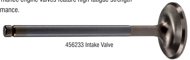
456233 Intake Valve