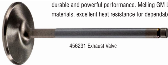
456231 Exhaust Valve

Precision engineering, selection of superior grade alloy materials and advanced manufacturing processes ensure that Melling GM LS Performance engine valves meet the exacting specifications required for efficient, durable and powerful performance. Melling GM LS Performance engine valves feature high fatigue strength materials, excellent heat resistance for dependable performance.