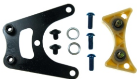
BD417-DBRKT Damper Bracket Kit W/Damper