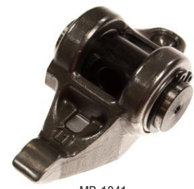
MR-1341 With Centered Rocker Arm Tip