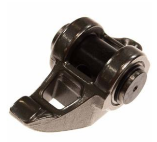
MR-1342 With Offset Rocker Arm Tip