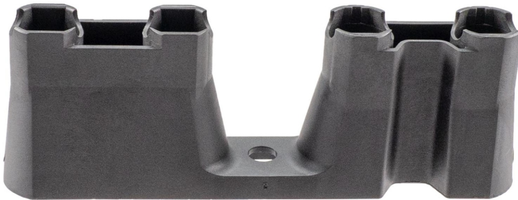
Front Lifter Guide With Active Fuel Management