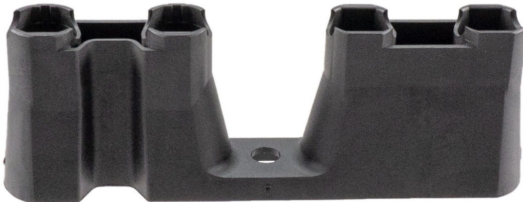
Rear Lifter Guide With Active Fuel Management