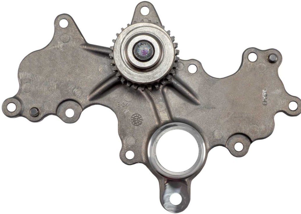
Idler Sprocket & Water Pump Cover Assembly with Gasket