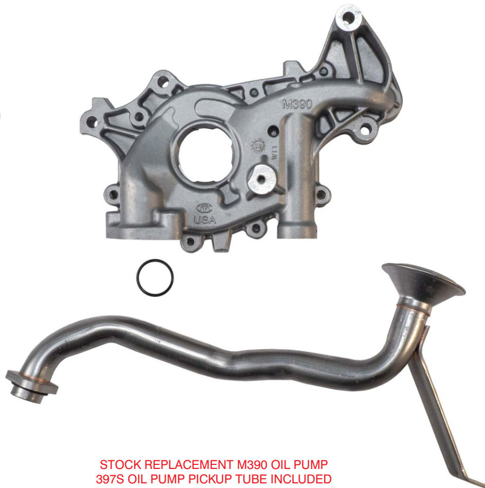
STOCK REPLACEMENT M390 OIL PUMP 397S OIL PUMP PICKUP TUBE INCLUDED

** Always consult catalog listings for detailed application information**